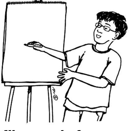
l will explain my thinking.